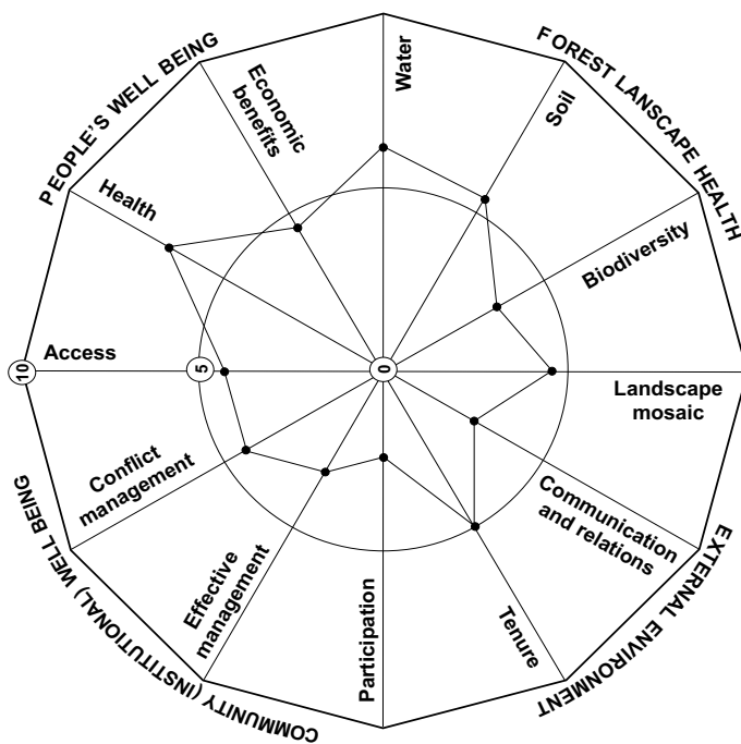
Figure 2. Example of a Spider Web Diagram.

One potentially useful way to visually represent and track results of assessments over time is by using ‘Spider Web Diagrams’ (see Figure 2 below) 27 . This involves creating an image like a spider web, or a (flat sided) bicycle wheel and spokes, and assigning each one of the spokes a theme from the C&I set (usually at the level of Criteria). By considering the very centre to be a zero value ( i.e. , very poor), and the outside edge to be a value of 10 (excellent), the approximate scores of each Criteria can be